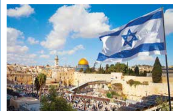
Jerusalem Western Wall

SENIORS still want to travel and see the world, but often struggle to keep up with regular, fast-paced tours... or feel vulnerable travelling alone.