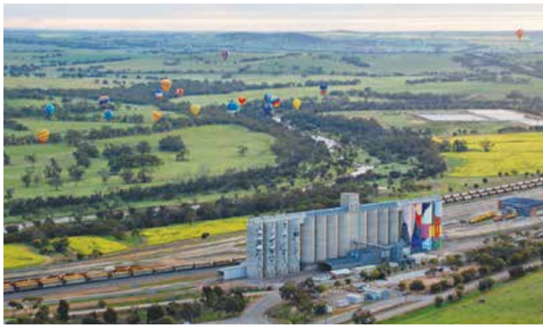
Balloons over the Northam grain silos

ALL eyes will be on the skies in Northam this September when the